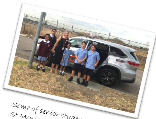
Some of senior students off to St Monica's

I would like to draw your attention to our uniform code and I seek your support in ensuring all children are correctly attired. It is an expectation of the school that our uniform is adhered to which will ensure high standards.